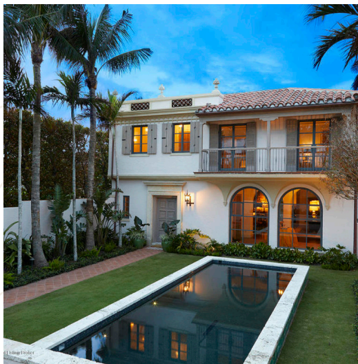
9 Golfview Road