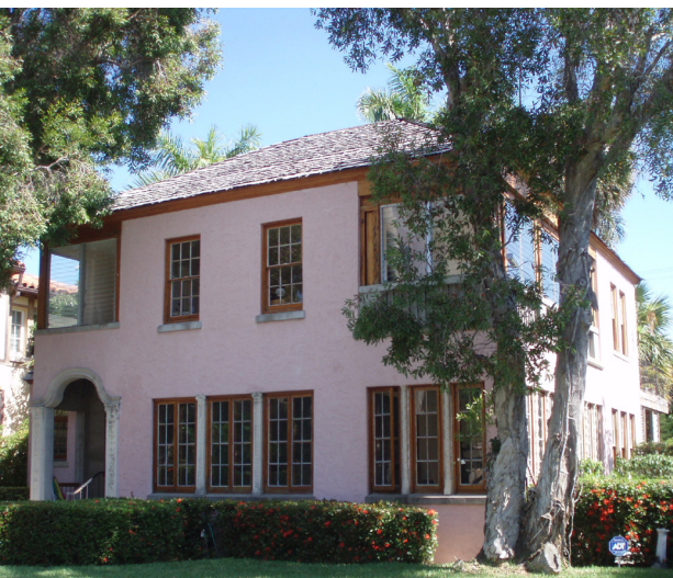
323 Chilean Avenue